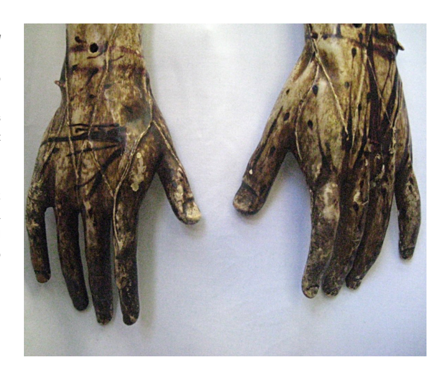
FIGURE 6. The Lord of The Three Falls. Anchoring orifice to hold up the hand; detail of wounds and veins on the left hand.