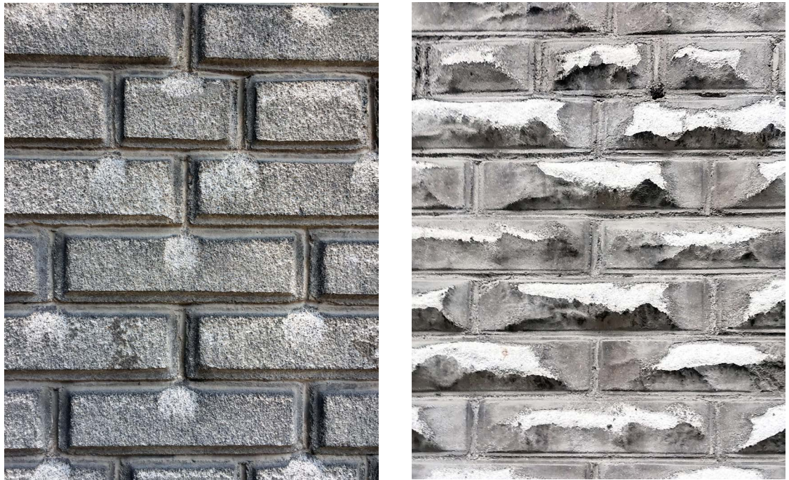
FIGURE 2. Two types of cement bricks (20 x 10 x 6 cm). Left, detail of smooth partition wall rigging with bevel; right, detail of grotesque partition wall rigging with bevel (Photographs: Alejandro Leal & Alberto Muciño, 2020; source: Authors' Collection).

wall was abandoned in favor of more slender walls of a single manufacturing (Chanfón, 1998, p. 366).