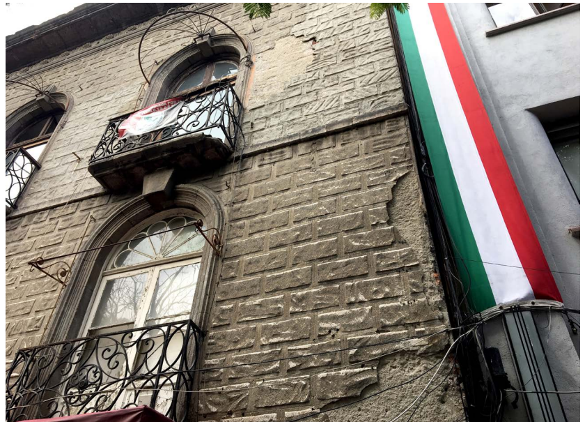
FIGURE 9. Flattened facade that looks like cement partition wall, which verifies that, beyond the technical advancement, there was an aesthetic tendency of the apparent partition wall (Photograph: Alejandro Leal & Alberto Muciño, 2021; source: Author's Collection).

This rupture would then come with the widespread development of reinforced concrete as the most popular and economical material. Used in conjunction with the construction procedure of confined masonry, it would eventually become, in construction terms, the predominant system, even up to the present day. In addition to having a technical and economic nature, this preference is also a matter of taste, a circumstance that in part determined the abrupt end of the trend in apparent brick architecture in favor of smooth or textured plastered facades that did not emulate brickwork (a very visible aspect in the art deco architecture of the late 1920s). It would also be the reason why historiography has disdained this architecture in apparent brick, on the one hand, by not differentiating it from eclectic architectures built in other ways, and, on the other hand, given the idea that all eclectic architecture is synonymous with Porfiriato and the 19 th century; finally, apparent brick architecture was overshadowed by the Revolution that reinforced concrete represented and the triumphant idea of modernity that it embodied.