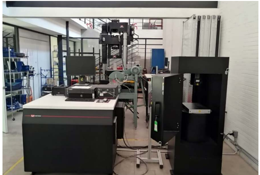
FIGURE 5. Instron® compression testing machine, model 400RD, capacity 200 t (Photograph: Alejandro Leal & Alberto Muciño, 2021; source: Authors' Collection).

After performing mechanical compression tests with the maximum load applied, the relevant equations were carried out to show the maximum stress to strength, obtaining the following results (Figure 6).