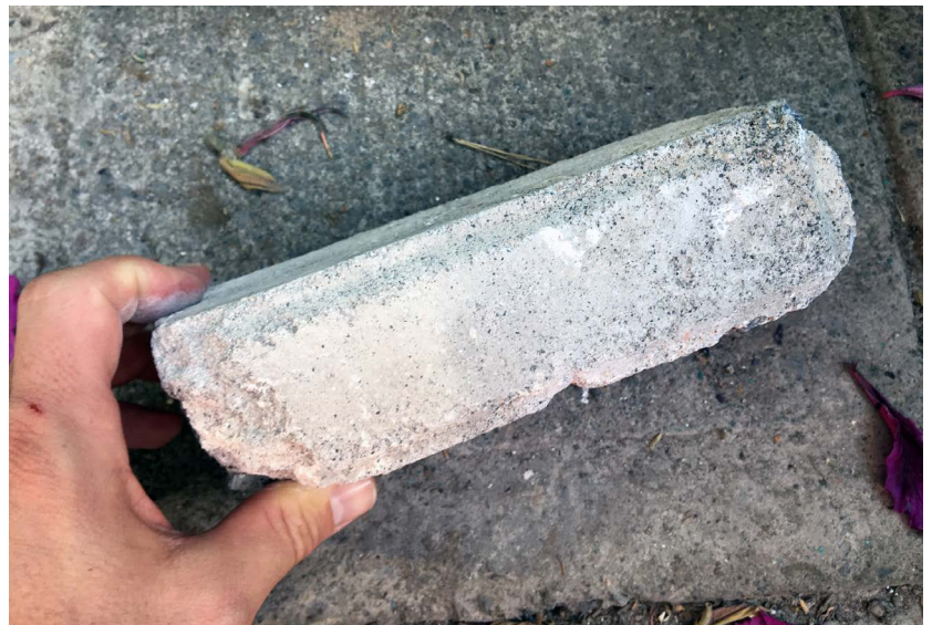
FIGURE 3. Sample of a cement partition wall (20 x 10 x 6 cm) smooth and with bevel, extracted in 2020 from the facade of the house located at Pomona No. 38, col. Roma Norte (Photograph: Alejandro Leal & Alberto Muciño, 2020; source: Authors' Collection).

To learn about the mechanical behavior of cement brick under axial compression, in 2021 a study was carried out on samples at the Laboratorio de Materiales y Sistemas Estructurales (LMSE, Laboratory of Materials and Structural Systems) of the Facultad de Arquitectura (FA, Faculty of Architecture) of the Universidad Nacional Autónoma de México (UNAM, National Autonomous University of Mexico), in which the physical mechanical characteristics were measured (Figure 3). The mechanical analysis of cement bricks not only shed new light on the reasons why it was used so frequently in that period, but also provided elements to explain its permanence over time since today we can still observe it in countless facades in Mexico City's downtown area and in most of urbanizations 12 that were developed at the beginning of the 20 th century, in what are now the neighborhoods known as Condesa, Roma Norte, Juárez, San Rafael, Santa María la Ribera, Doctores, San Pedro de los Pinos, Del Carmen Coyoacán, etcetera. 13