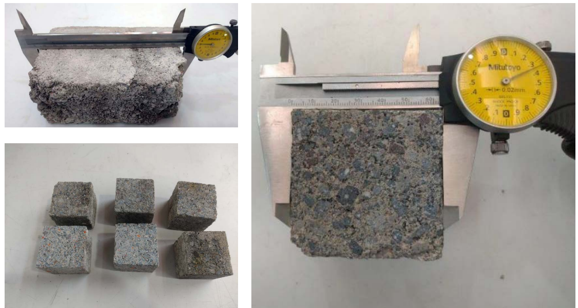
FIGURE 4. Three images showing the preparation process of the piece, in 2020. To acquire the compressive strength, a load was applied at a constant speed and parallel to the longitudinal direction of the specimen, recording the maximum load at failure (Fult), like what has been done by other researchers (Photographs: Alejandro Leal & Alberto Muciño, 2021; source: Authors' Collection).

The pieces called cement brick are made with mortar, and in order to know their physical mechanical properties today (2023) and, therefore, to observe if mortar strength is preserved based on the current regulations, pieces were extracted from the building located at 38 Pomona Street in the Roma Norte neighborhood, in the Cuauhtémoc district of Mexico City, which had an average size of 6.45 \times 10.32 \times 15.05 cm. 14 It was decided to extract at least six of them, to test them under simple compression, selecting those with a more uniform geometry. These pieces were prepared for compression testing according to the parameters established by Mexican Standard NMX-C-038-ONNCCE-2013 (Norma Mexicana, 2013), and because of the cubic geometry of the specimen, three measurements of length, width and height were taken for each piece, to average the values obtained (Figure 4).