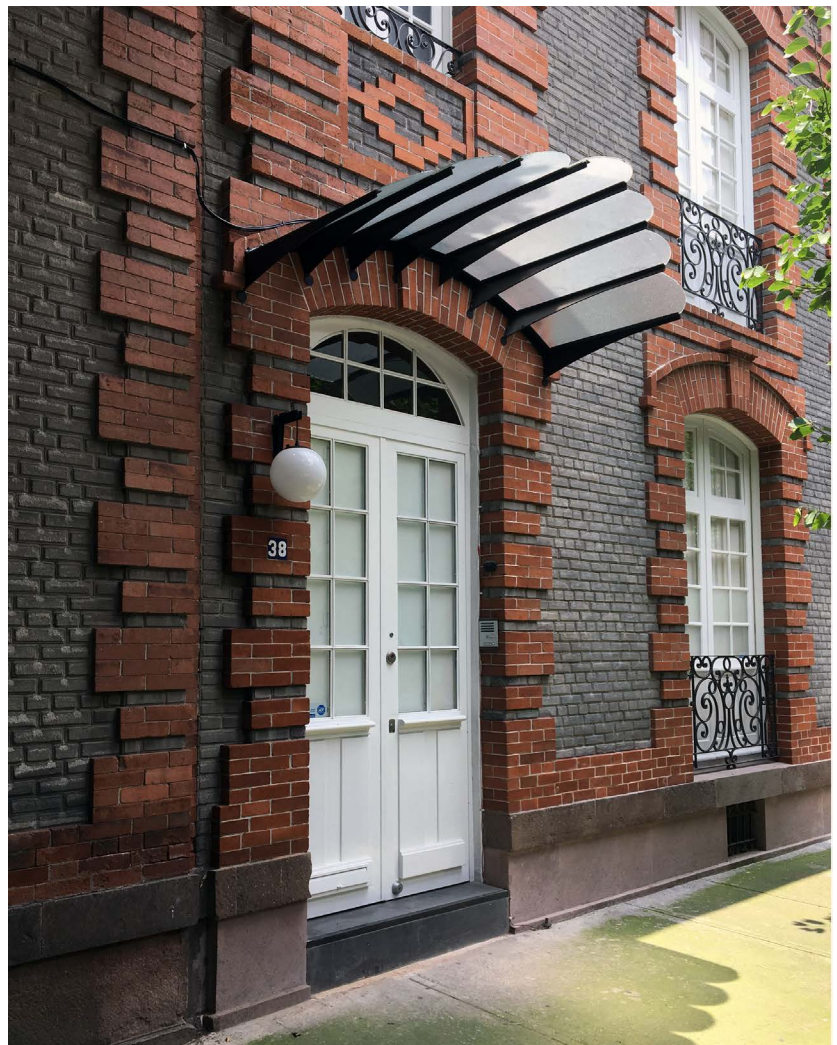
FIGURE 1. Facade in exposed brick in the house Pomona No. 38, Roma Norte, Mexico City. The use of two types of brick in a polychromatic composition is observed, Huerta brand industrialized red brick (22 x 10 x 6 cm) and cement brick (20 x 10 x 6 cm) smooth with bevel. Work attributed to architect Manuel Cortina García (Photograph: Alejandro Leal & Alberto Muciño, 2020; source: Authors' Collection).