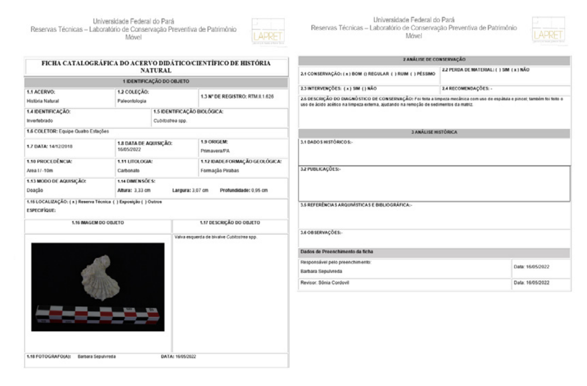
FIGURE 1. Form template used prior to 2022, created using Microsoft Office Word.