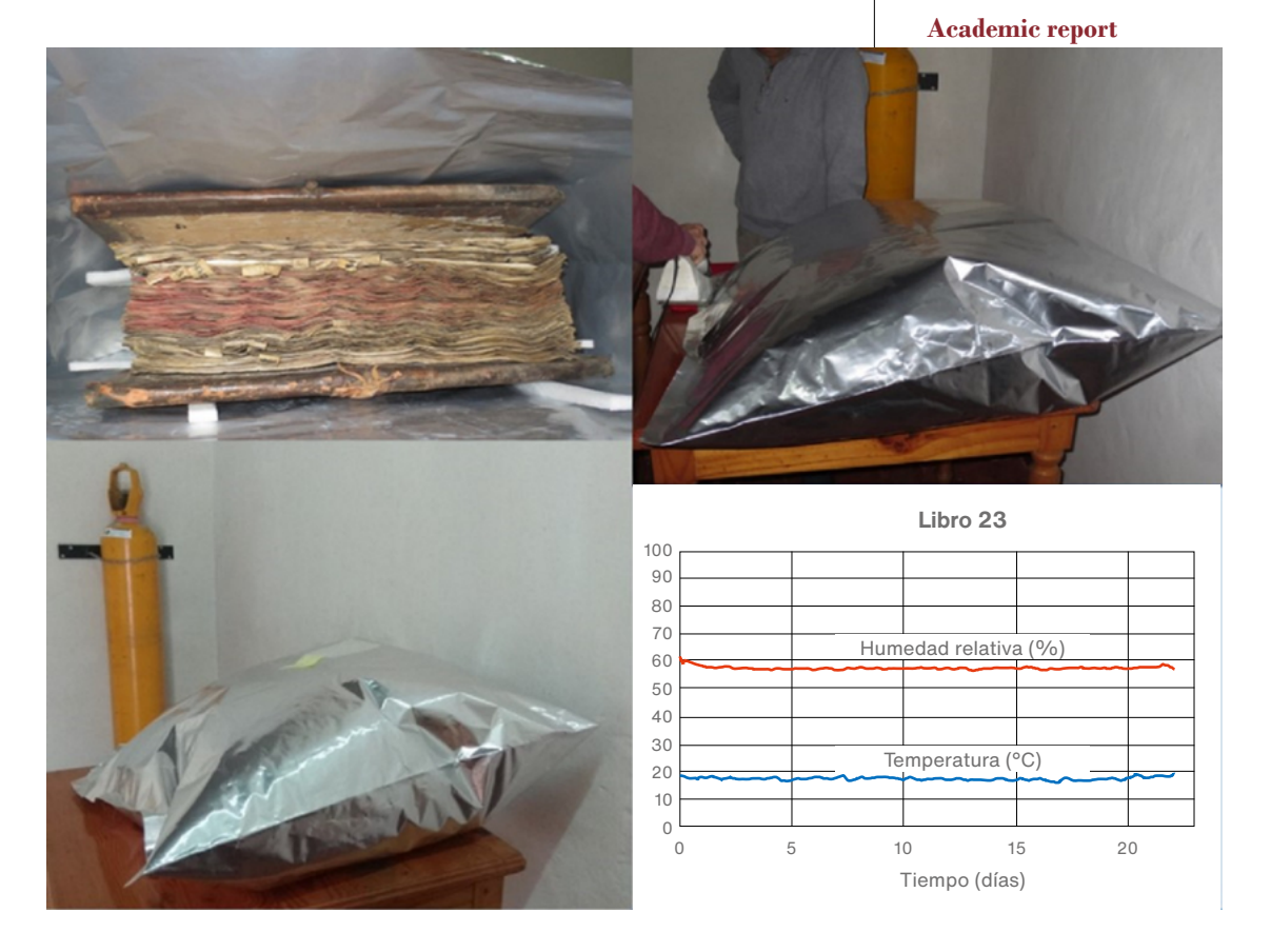
FIGURE 4. Anoxic treatment of Book 23: heat sealing of a nitrogen-filled bag, humidity and temperature monitoring during treatment.

book, not subject to anoxic treatment), with an interval of 173 days between the analyses. As can be seen in Figure 5, in the period of just under six months between taking the X-ray plates, the damage caused by termites increased in the covers of the control book, where the cavities extended and branched.