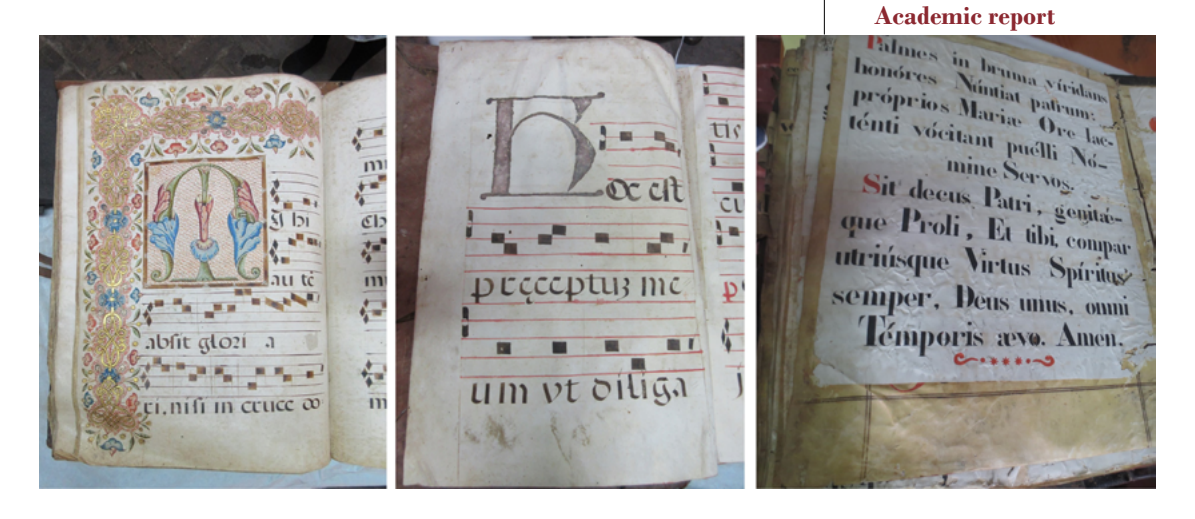
FIGURE 1. Illustrations and writing inside the choral books.

vironments. They feed on various organic materials, such as paper, cardboard, and wood, and, mainly, those that contain polysaccharides, like starch or its derivatives. Their excrements can stain cardboard or paper surfaces. Silverfish—along with as some other insects—can remain inactive for months due to lack of food, a characteristic that makes their elimination difficult (Querner, 2015, p. 601).