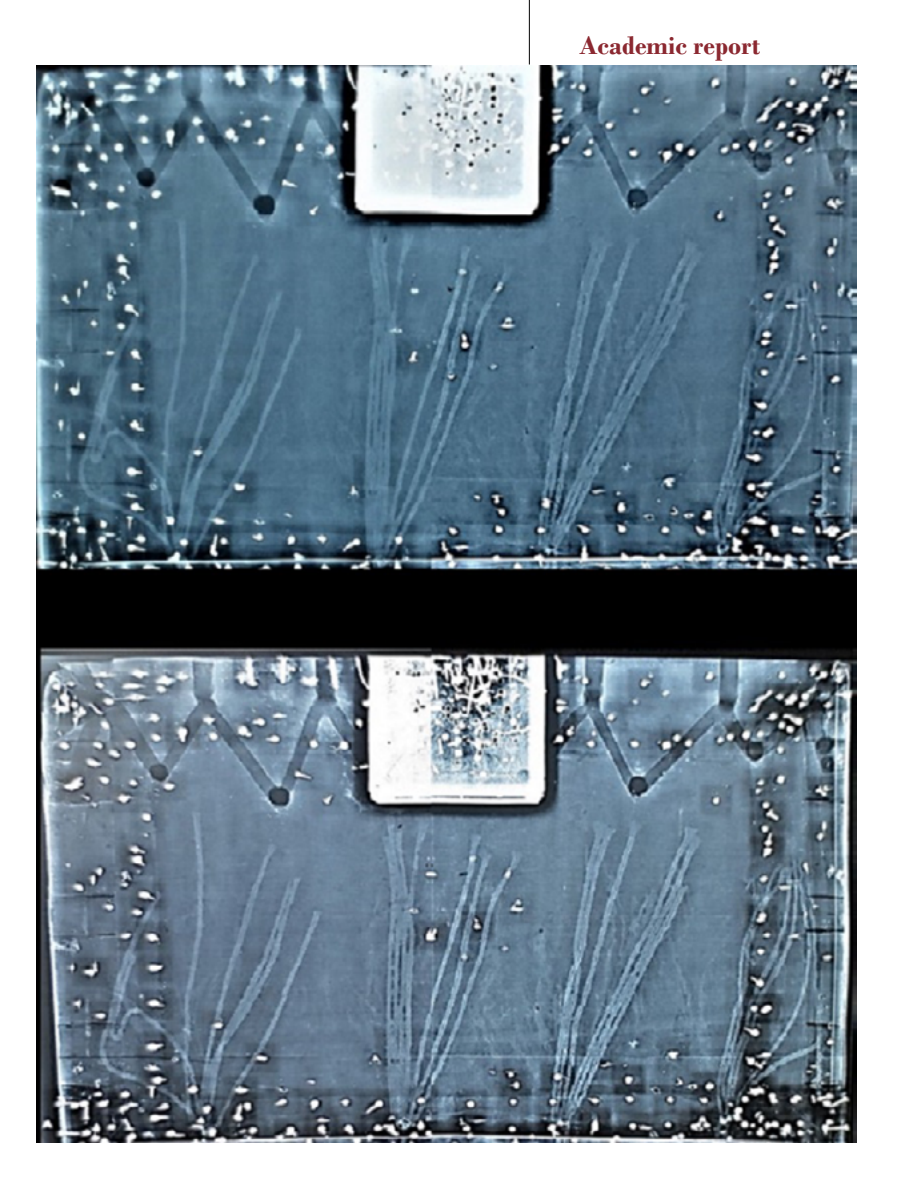
FIGURE 6. X-ray images (taken with an interval of almost 8 months) of the front cover of Book 23 subjected to anoxic treatment (above: before the treatment; below: 230 days after taking the first plate) (Photographs: Javier Nakamatsu, Jhonatan Arízaga, Ivon Canseco, and Patricia Gonzales: courtesy: Museo del Convento de los Descalzos).