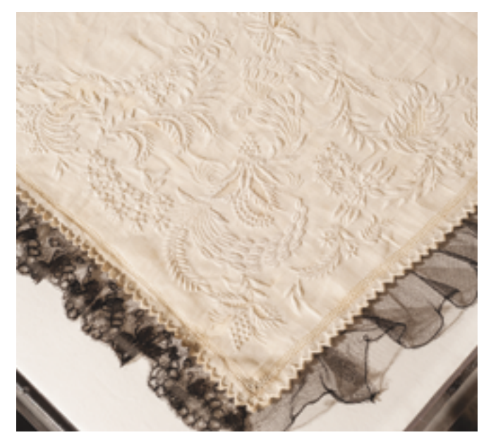
FIGURE 4. Detail of the object's condition after conservation treatment, obverse of the cloth (Photograph: Omar Dumaine, 2014; courtesy of: Secretaría de Cultura, Instituto Nacional de Antropología e Historia [SC-INAH], México; Reproduction authorized by INAH).

It is well known that "each intervention is directed by what is seen as the role of the object" (Eastop 2006:526). In this case, the textile was regarded as a museum object