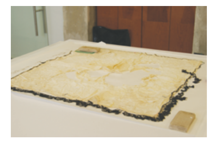
FIGURE 1. Reverse of the cloth, treatment in progress.