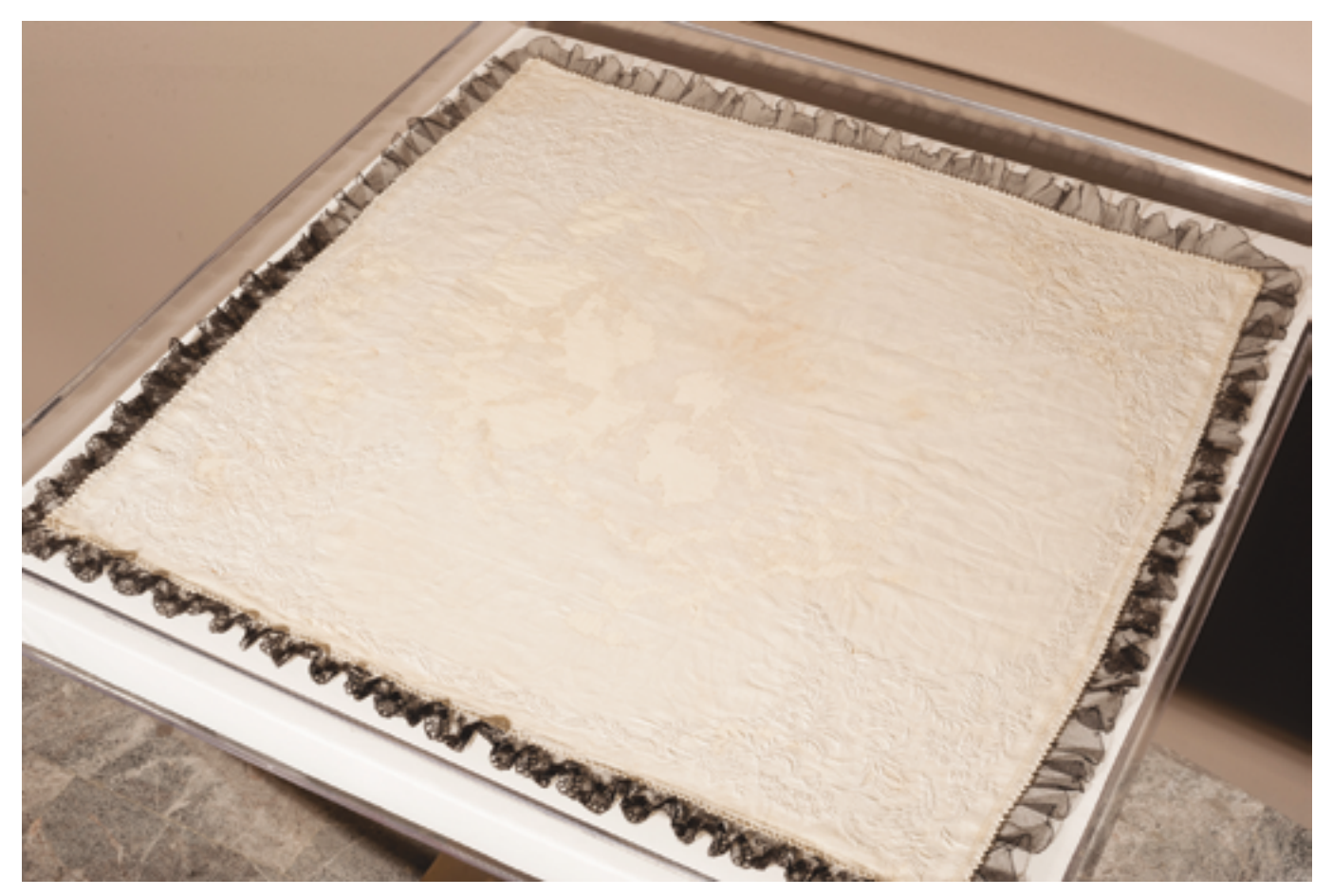
FIGURE 5. Display of the funerary cloth (Photograph: Omar Dumaine, 2014; courtesy of: Secretaría de Cultura, Instituto Nacional de Antropología e Historia [SC-INAH], México; Reproduction authorized by INAH).

the object, quite likely because of the space that was designed for it within the exhibition (INAH 2015b). The funerary cloth was displayed beside a mourning dress and a mourning shawl in a room section named Preserving to transmit (Figure 5), which focused on the way textiles can activate transmission mechanisms through generations, while managing to trigger some feelings of grief in the public (INAH 2016).