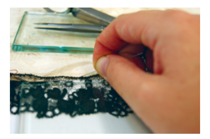
FIGURE 2. Detail of lace and its manufacture technique, treatment in progress (Photograph: Laura Gisela García Vedrenne, 2014; courtesy of: Secretaría de Cultura, Instituto Nacional de Antropología e Historia [SC-INAH], México; Reproduction authorized by INAH).

the same archive, I came across photographic evidence of the cloth covering the conqueror's skull ( Life Maga zine 1946:43-46) (Figure 3). Both of these were groundbreaking findings that confirmed the object's relevance to the historic events. Once the provenance of the object became clearer, the MNH-INAH director expressed his desire for the funerary cloth to be included in the upcoming temporary exhibition Hilos de Historia . Colección de In dumentaria del Museo Nacional de Historia (Threads of History, Apparel Collection of the National Museum of History ).